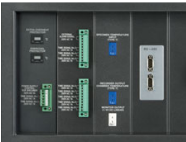
Terminal area (including option)

* Continuous operation at or below +40°C is limited because of frost formation on the cooler and dehumidifier.