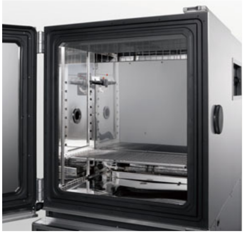
Cable ports on both sides

The AR Series conform to safety standards ISO12100-1, -2, and ISO14121; also to CE marking requirements based on EU directives: Low voltage directive, EMC directive, machinery directive, and pressure equipment directive. (Refer to specification pages for compatible models)